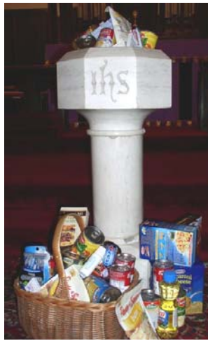
The Baptismal Font at St. James with food for the CRC