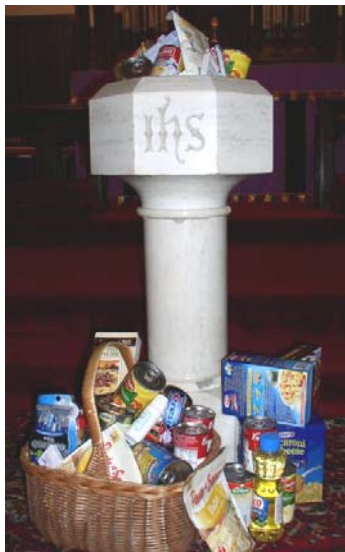
The Baptismal Font at St. James with food for the CRC

Please continue to bring canned and other nonperishable food items to be delivered to the Clintonville Resource Center food pantry. Needed especially this month are tuna and fruit juice. Also, non-food items are always welcome, as the Food Assistance Program does not cover these items (think cold and flu season, think facial tissue!). Please bring your donations to mass on Sundays or Wednesdays and place them in (or around) the baptismal font before mass or as you approach the altar. Our baptism calls us to service. What better image could remind us of